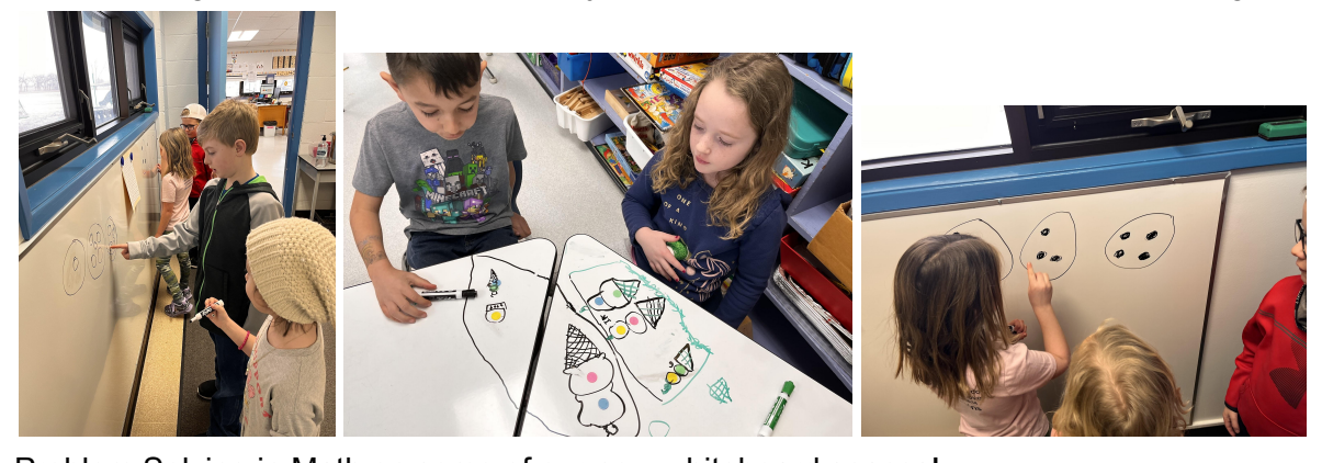
Problem Solving in Math on some of our new whiteboard spaces!