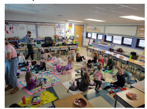
Teddy Bear Picnic and Teddy Bear Dance party

What a fun month in Kindergarten! We had tons of new experiences and learned a lot! Below are a few photos from our month. It was jam packed with all sorts of exciting activities.