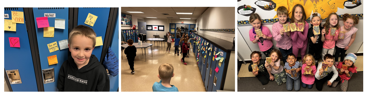
Our week of kindness celebration was a huge hit. A simple sticky-note can bring so much joy!

Gratitude: A special thanks for the wood donated to our class by the Vucurevich Family...so much fun to build!