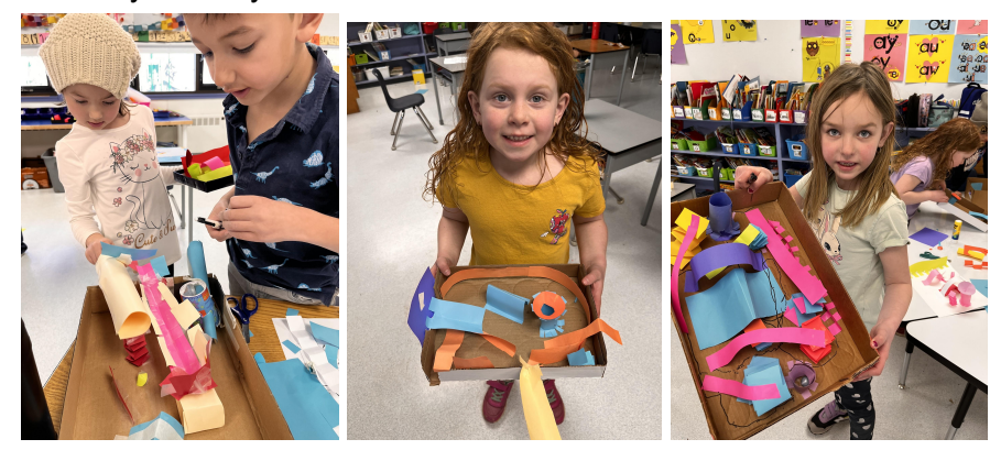
Using paper folding techniques to build marble tracks was so much fun. I think we may have some future engineers in gr 1/2!

February went by in a flash! Take a look at some of what we have done in the past few weeks!