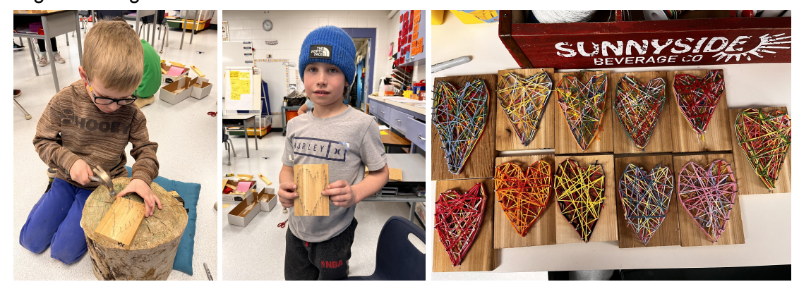
More building! This nail and hammer project has inspired us to make even more during wellness time.