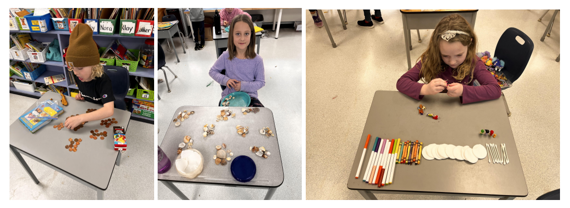
Our 100th day of school collections! So many ways to share, count and sort our collections!