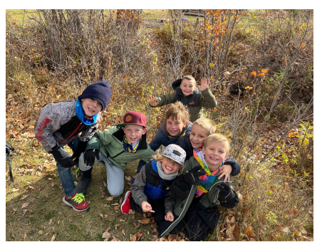
It was a brisk morning in Pavan Park, but it was filled with laughter, learning and connections! We'll be looking for more volunteers for our November 29th trip so let us know if you'd like to join! We'd love to have you!