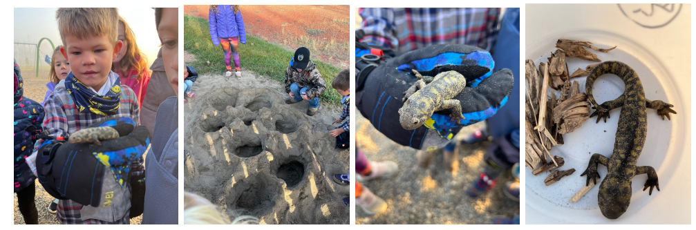
Digging tunnels in the sand led to an amazing amphibian discovery by some of our grade 1's! This Tiger Salamander paid us a short but incredible visit before we released it back into the wild.

Reading is a huge part of our day. Our daily routines include reading with partners, reading with teachers and reading on our own! We are building our phonetic skills and finding books we love to read and share!