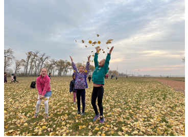
If you can't beat the wind, you might as well join it!