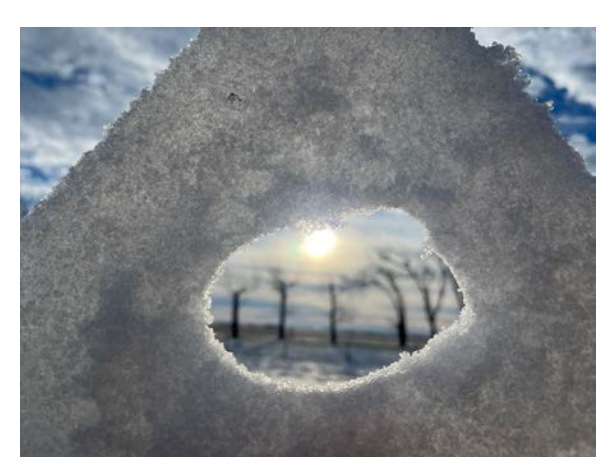
Snowshape by Grace Keating