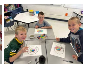
Students made "Circles of Belonging" to reflect on their place in their communities, families, and the world! We are connected in so many ways!