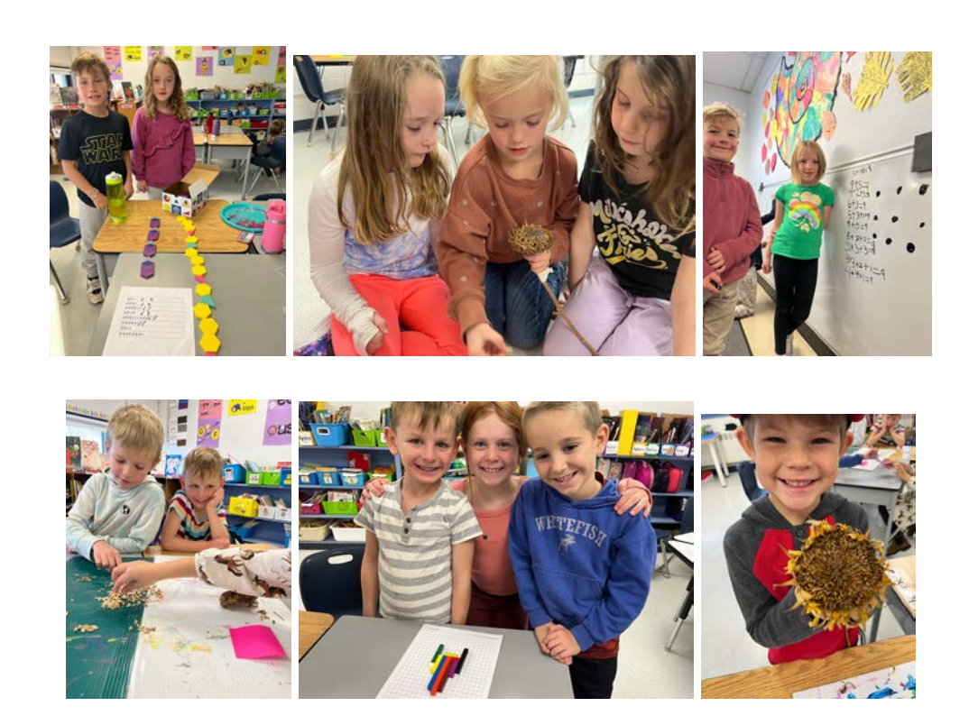
Patterns, math challenges, counting sunflower seeds (phew!), collecting data, and exploring numbers to make 10...math is everywhere in grade 1/2.