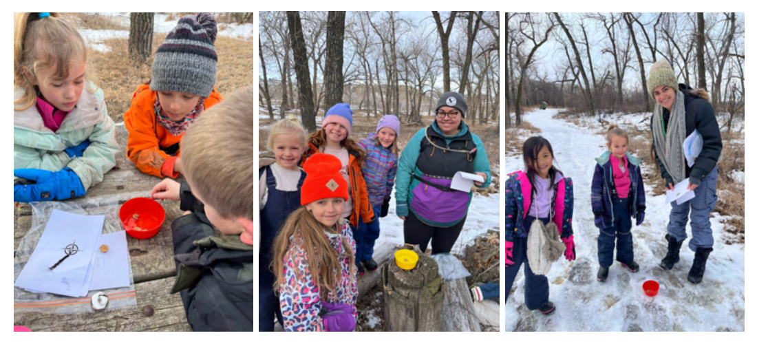
Finding North in Pavan Park by making our own compass!