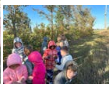
Pavan Park: We are excited to continue our monthly trips to Pavan Park. Please let us know if you can join as a volunteer!